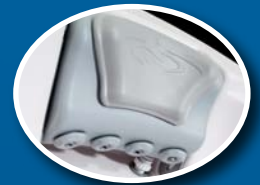
2 NeckFlex Pillows